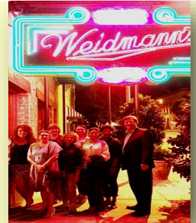
CAP Inspection Team in Meridian, MS. September 2017