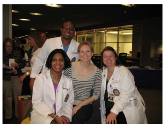
Academy events are always a good time to catch up with colleagues — even those in your own department!