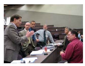
Members collaborate to plan the Academy's future direction.

The OMERAD serves as the base of operations for the health sciences centerwide LSUHSC-NO Academy.