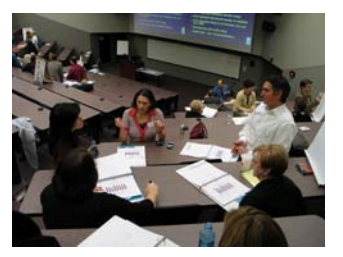
Academy members share perspectives from their different schools.

The OMERAD serves as the base of operations for the health sciences centerwide LSUHSC-NO Academy.