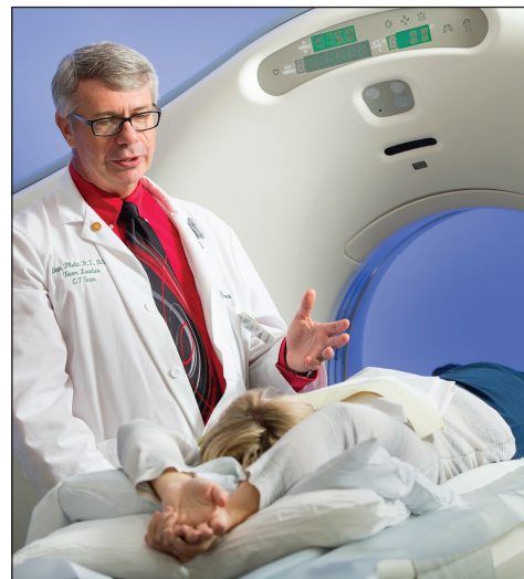
Lung cancer screening with low-dose CT is fast and takes only a few minutes to complete

Major medical societies recommend that lung cancer screening be done at medical centers with access to multi-disciplinary lung cancer diagnosis and treatment programs. Since the first scan can lead to additional testing, find a center that has the ability to interpret and respond to your results. Sometimes lung cancer screening identifies other things not related to lung cancer that may require follow up.