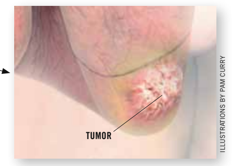
Adenocarcinomas are found near the edge of the lung.

anywhere in the lung and tends to grow aggressively. There are other, less common subtypes of NSCLC. While smoking is the single biggest risk factor for developing NSCLC, people who quit smoking decades ago, and those who have never smoked at all, can develop NSCLC.