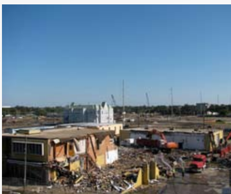
With the last political burdle cleared, demolition and construction moves full speed ahead!