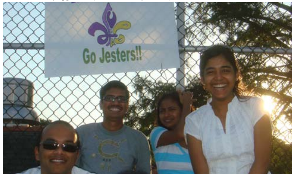
Several LSUHSC postdocs enjoy a night out at the Jesters game.

Elections in November! All active members are encouraged to run for a position-excellent learning opportunity and it looks great on your resume!