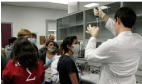
Elementary and middle school students learn about heredity, cells, and DNA. They sometimes isolate DNA from strawberries and manipulate candy twists to simulate chromosome instability during cancer progression.