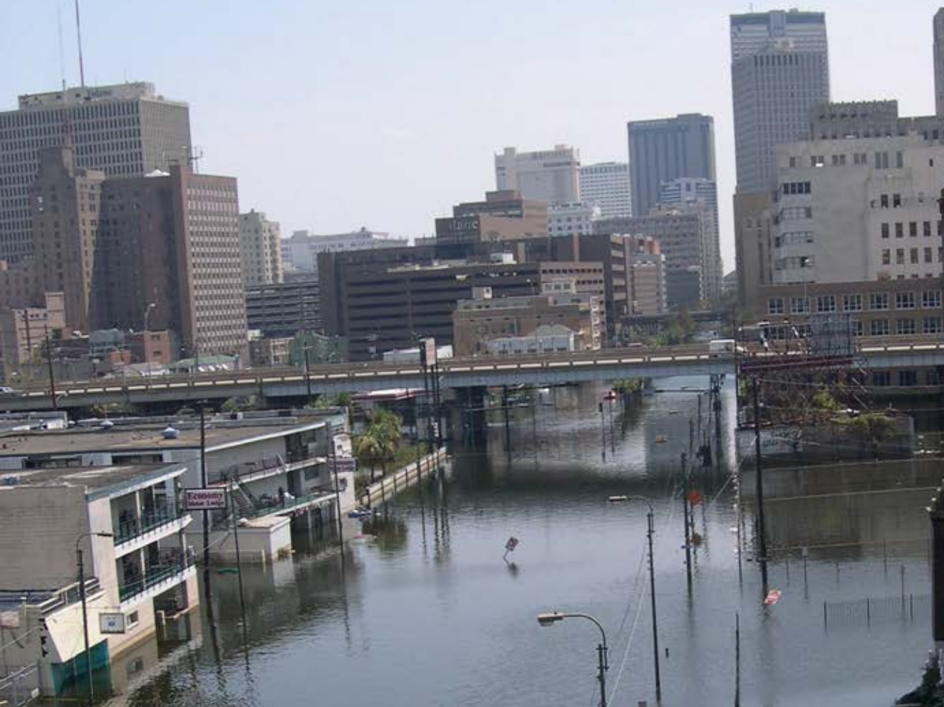
View of Tulane Avenue toward Claiborne Avenue, ten days after Katrina.