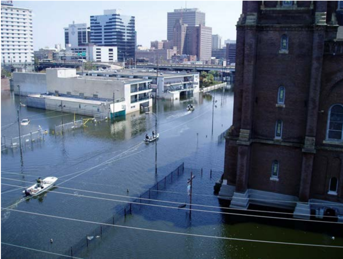
Coast Guard patrols an inland waterway formerly known as Tulane Avenue.