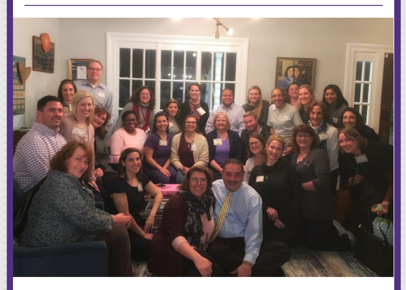
Great turnout for LA pediatric palliative care consortium (information)

We are looking for volunteers for an evening of service on February 13th from 5:30-7:30 PM at Second Harvest Food Bank. If interested, please email Amanda Glinky at <a href="mailto:aglink@lsuhsc.edu">aglink@lsuhsc.edu</a>.