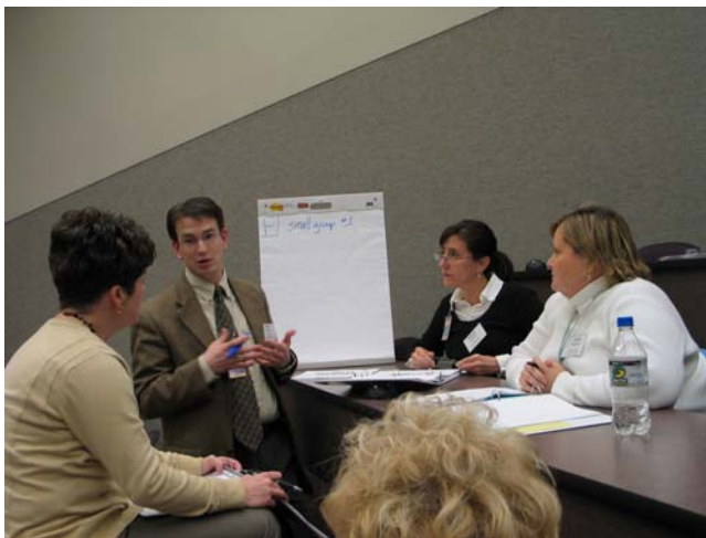
Academy members work in teams to plan, learn, and advance excellence and scholarship in teaching and education.