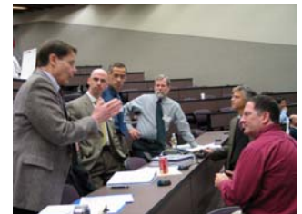
Members collaborate to plan the Academy's future direction.

The OMERAD serves as the base of operations for the health sciences center-wide LSUHSC-NO Academy.