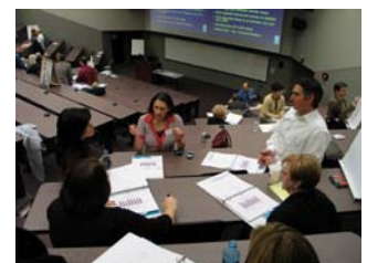
Academy members share perspectives from their different schools.

The OMERAD serves as the base of operations for the health sciences center-wide LSUHSC-NO Academy.