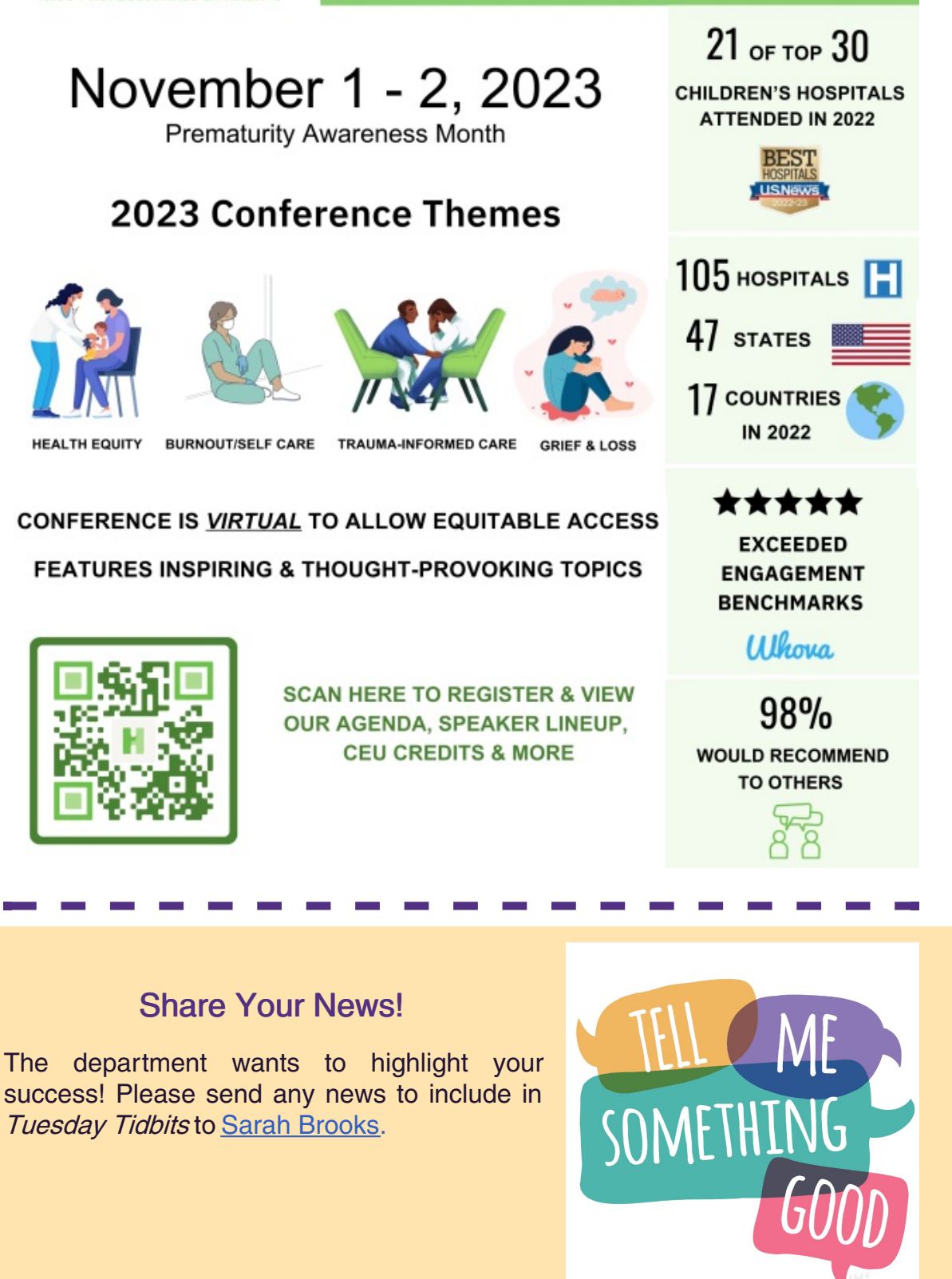
to learn, engage and discuss critical mental health topics important to NICU professionals & parents